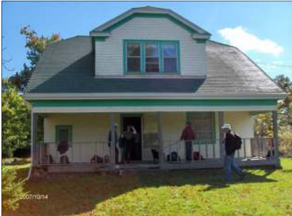
Lynch House Open for Visitors one day a year

This year the Friends included visits to the Conrad-Davis and Matthew Lynch houses at the north end of McNabs Island as part of their Fall Foliage Tour. Scores of people choose to rest and picnic on the lawns outside the houses as the weather was so warm and sunny. Others took advantage of the day's "Open House" to explore the interior of these homes.