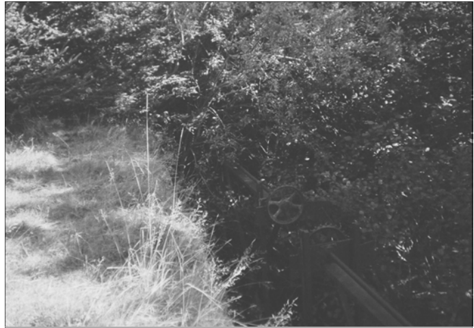
Mechanics to hoist targets at the end of the Range