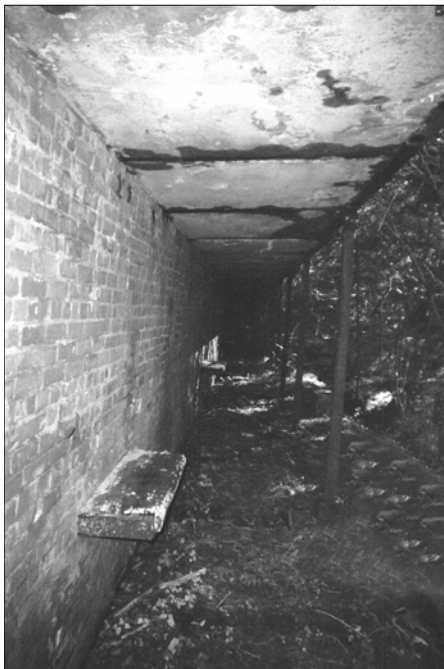
Mysterious “bus stop” off Green Hill Cove Trail

We had been warned the trail was challenging, maybe a bit extreme so we were expecting to meet some impassable situations that would cause us to turn back. However, with our maps, and a good sense of space and direction, we found that the trail was quite distinct and simply narrowed. The worst problem for us was that a trench, formed in the middle of the trail, had filled with water. By just wearing regular running shoes, we risked damp feet and were so ill prepared for the wet ground. But, both of us continued on undaunted stopping only to marvel at some of the natural wonders we happened upon. At the end of the trail there was a clearing and then the abrupt great drop at the end of the range. There still stands the rusted mechanics used to hoist targets up and down on the range. Of the entire day's hike this should be a cautionary point to remember if you follow in our footsteps. Care and attention is advised, there is a possibility of falling off the wall into the crevasse but it is really only a possibility for the foolhardy or reckless.