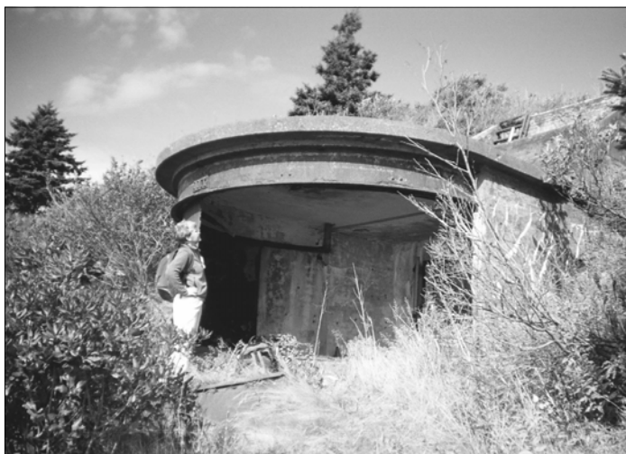
Judith at the searchlight emplacement at Strawberry Battery

We returned to the trail and soon came to a point of the island where we could look across the harbour to Lawlor's Island. We walked along the beach and took the small natural causeway through the marsh at Green Hill Cove. We needed to poke about a bit to find a dry place to rejoin the Culliton Farm Trail and enter the woods again. The Culliton Farm Trail was wide and clear, easy hiking. We stopped at the site of an old farmstead on the left side of the trail. It was here that we met the first person on our hike after leaving the group at Garrison. I think most people had made their way to the north end of the