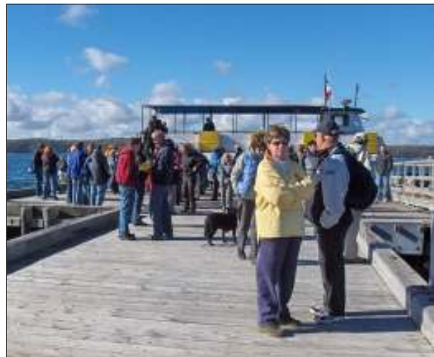
People assembling to leave McNabs Island