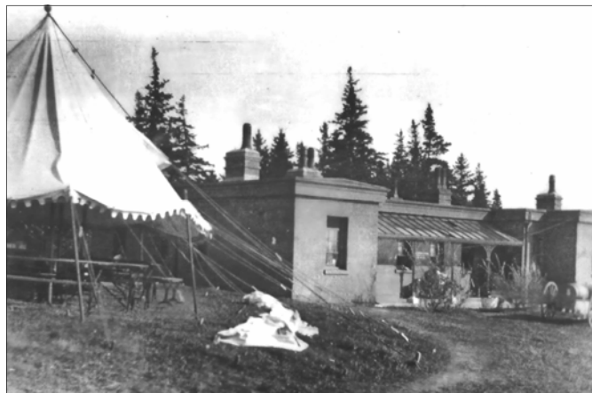
Hugonin Barracks Officer's Quarters circa WWI

The Department of National Defence has issued a tender notice for the DEMOLITION of structures at FORT HUGONIN on McNABS ISLAND. The Friends of McNabs Island Society strongly opposes the planned destruction of this historic resource on the island.